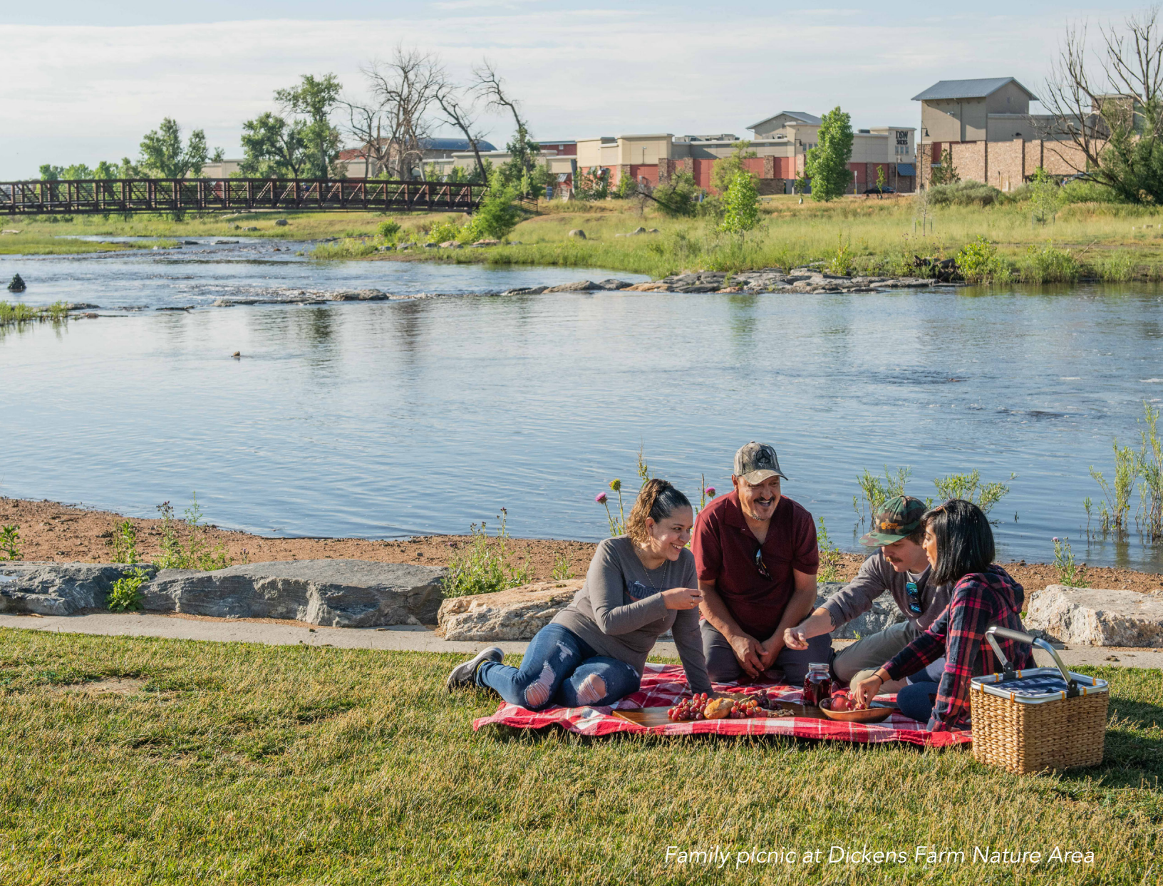
Family picnic at Dickens Farm Nature Area