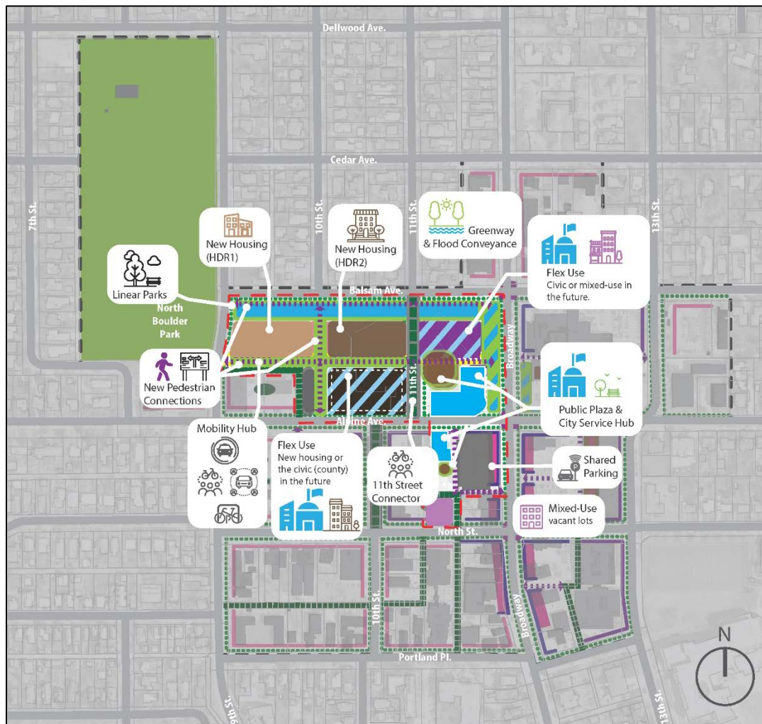
Conceptual Diagram of City Site Future Uses and Improvements, Area Plan page 12

Renovation of the Brenton building completed in 2018 demonstrated early successes on the campus by consolidating a fragmented department into one building and converted one of the city's worst energy performing buildings into a now near net-zero energy consuming building. Renovation of the Pavilion building and improvements to the site will create a cohesive campus that has the potential to consolidate staff from at least four additional buildings. The City Council approved 2020 budget includes the first phase of the city campus and Pavilion design work. More information on the consolidation of city services can be found at the following council memo links: November 13, 2018 ; February 12, 2019 ; and May 16, 2019 .